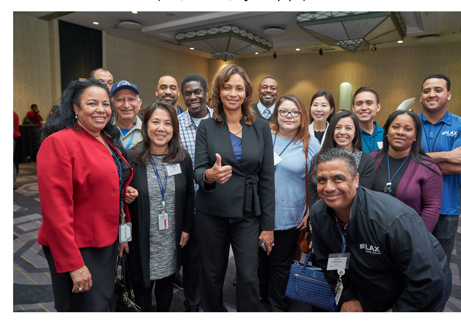
AnchorLAX: A Strategy for Job Creation & Quality Careers