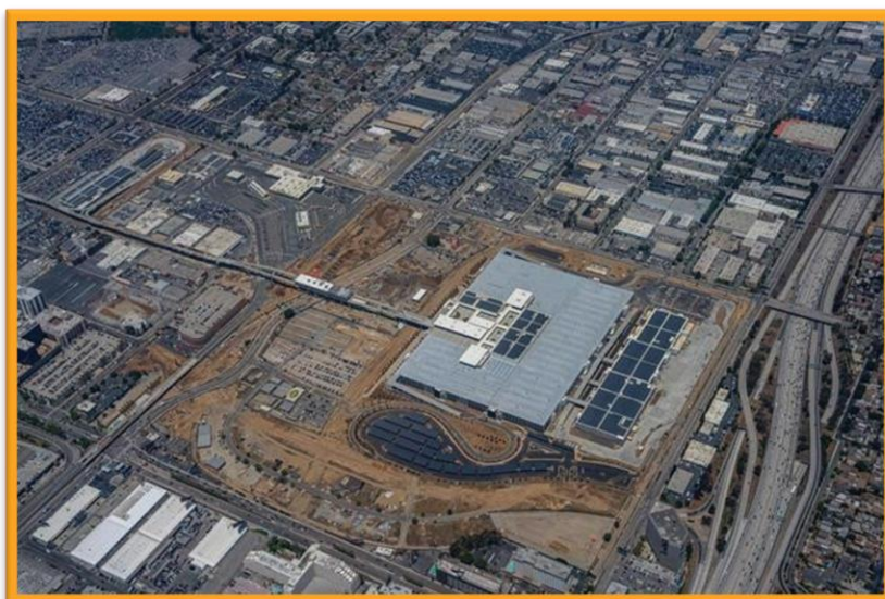
An aerial view of the ConRAC Facility, located next to the 405 Freeway