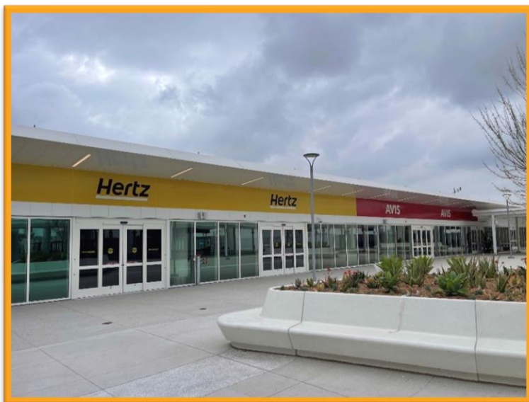
The rental car tenants that will operated at the ConRAC have started to build out their customer services spaces marking a major construction milestone