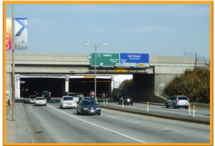
Sepulveda Boulevard Tunnel Cleaning by BSS