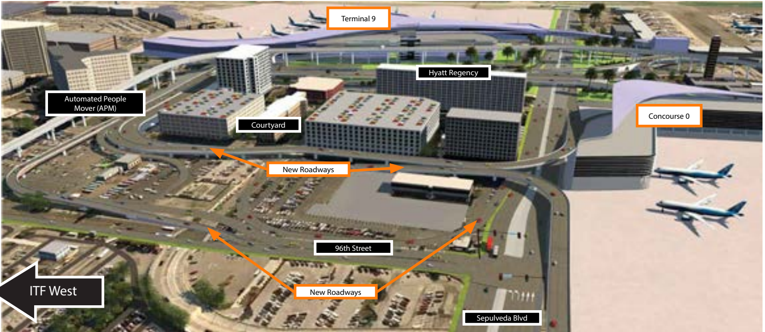
LOOKING SOUTH ALONG SEPULVEDA BOULEVARD