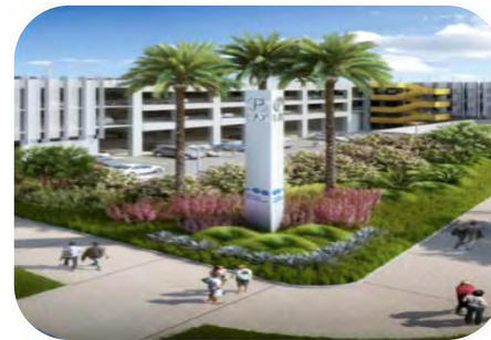
Intermodal Transportation Facility (ITF) East & West