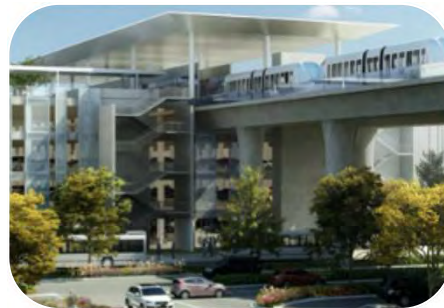
Consolidated Rent-a-Car Facility (ConRac)