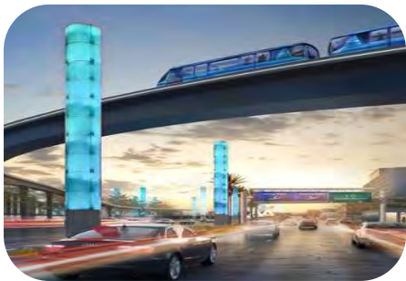
Airport People Mover (APM)

Key sustainability features include over 4MW of solar, an all electric train, and use of reclaimed water and drought-tolerant landscaping.